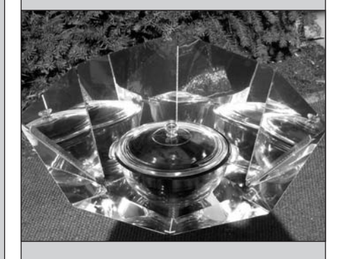
Figure 4 HotPot panel cooker ( photo: Christine Danton, SHE Inc).

The third and most recent design is the panel cooker. Its major features are low cost and increased portability, as the panels are hinged and can be folded up. Invented by Dr. Roger Bernard, it was initially adapted by Solar Cookers International for use in refugee camps. A commercial model developed by Solar Household Energy, Inc. is now available. In this model, called the HotPot, a black steel cooking pot with a wide flange is suspended inside a transparent glass bowl with a space of 1.3cm between the two. This assembly is covered with a glass lid and placed in front of a foldable reflector designed to deliver solar energy through the glass bowl to the black pot. The resultant heat is retained between bowl and pot by the pot's flange (Figure 4).