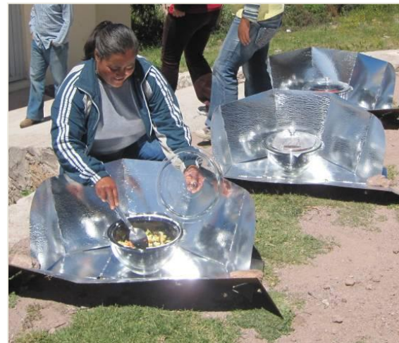
Queretaro native solar cooking with the HotPot distributed in 2009 Peace Corps project