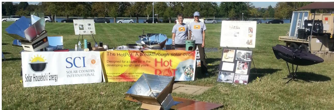
Solar Household Energy and Solar Cookers International partnered to promote solar cooking at the four-day STAR-TIDES event at Ft. McNair in Washington. (Acronym translation: Sharing Technology to Accelerate Research – Transformative Innovation for Development and Emergency Support)