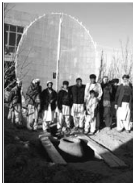
Figure 3 Scheffler cooker

The most powerful solar cooker is composed of a paraboloid reflector and a bracket to hold a pot. The reflector bends the rays of light so that they are concentrated at a focal point under the pot, making it very hot indeed. The focal point is so hot that this kind of solar cooker can fry food, unlike the other types of solar cooker. These cookers work like the burner on an LPG stove. Dr. Dieter Seifert developed a series of very efficient cookers of this type that are now in use around the world. Wolfgang Scheffler designed an 11-square meter reflector that concentrates intense solar energy onto an area about 30 centimeters in diameter. It is used for solar cooking on an institutional scale. (Figure 3)