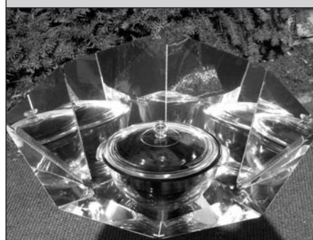
Figure 4 HotPot panel cooker.

The third and most recent design is the panel cooker. Its major features are low cost and increased portability, as the panels are hinged and can be folded up. Invented by Dr. Roger Bernard, it was initially adapted by Solar Cookers International for use in refugee camps. A commercial model developed by Solar Household Energy, Inc. is now available. In this model, called the HotPot, a black steel cooking pot with a wide flange is suspended inside a transparent glass bowl with a space of 1.3cm between the two. This assembly is covered with a glass lid and placed in front of a foldable reflector designed to deliver solar energy through the glass bowl to the black pot. The resultant heat is retained between bowl and pot by the pot's flange (Figure 4).