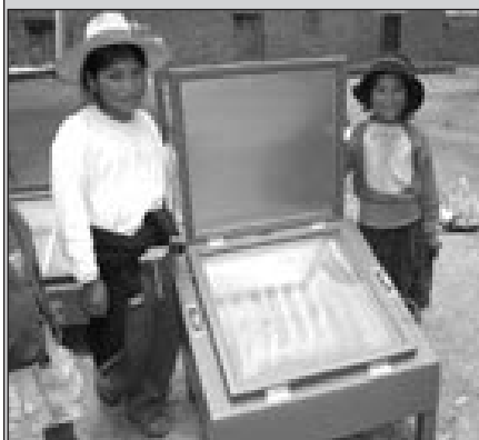
Figure 2 Box oven, Bolivia