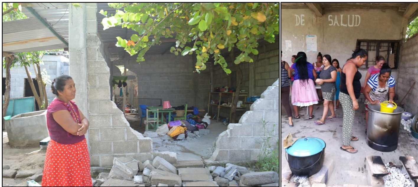
The magnitude 8.2 earthquake destroyed 11,000 homes in Oaxaca State. Community pop-up kitchens feed the homeless but fuelwood is running out. SHE is bringing relief through providing solar cookers and employment of solar cooking ambassadors in rural remote areas.

As Lorena's market research in small Oaxacan villages was under way, Mexico was hit with the strongest earthquake in a century , at magnitude 8.2. Oaxaca state was devastated, with over 76 deaths and more than 11,000 homes damaged or destroyed ( The Washington Post, 2017 ).