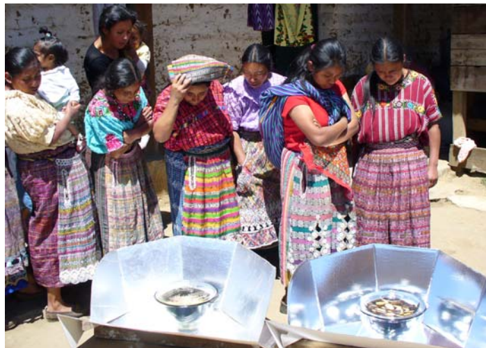
HotPot demonstration with Fundación para la Conservación de los Recursos Naturales y Ambiente en Guatemala, La Estancia, Guatemala

Elsewhere in Latin America, a modest pilot project in El Salvador with the Asociación Comunitaria Unida por el Agua y la Agricultura (ACUA) involving the distribution of 50 HotPots to women in the rural communities of Santa Marta, Nueva Amanecer, San Juan Buenavista, Nazareth, and Ojos de Agua, was greeted so enthusiastically that the project is now being followed by a much larger effort. Although the HotPot is generally purchased by individuals for purposes of cooking personal meals, one resident of that community uses her HotPot to cook snacks that she sells at local soccer games. The prospect of the HotPot’s utility as an income-generating vehicle opens the door to microcredit as a financing tool, as lenders generally decline to finance the purchase of consumer goods.