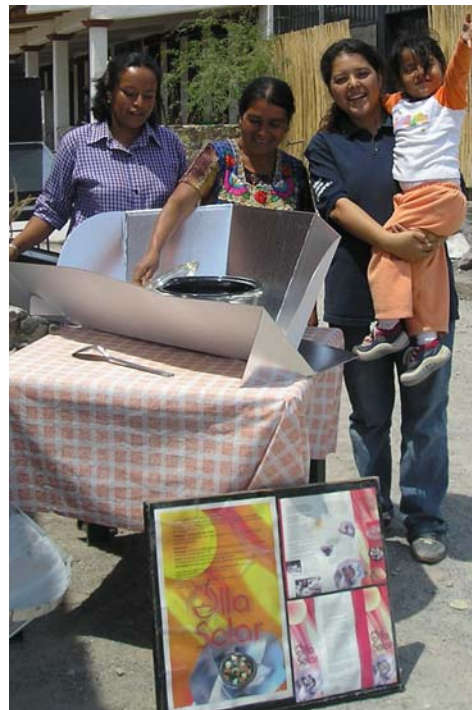
HotPot demonstration, Oaxaca, Mexico

In Mexico , we completed our hand-over of all program operations to our long-time partner there, the Mexican Fund for the Conservation of Nature (MFCN), following the successful completion of our two-year Partnership for Clean Indoor Air (PCIA) project there. The PCIA project, partially funded by a $149,400 U.S. Environmental Protection Agency grant, demonstrated solar cooking’s capacity to reduce human exposure to smoke caused by cooking with wood-fueled fires. Solar Household Energy’s project was notable in that all other nine PCIA-funded pilot projects involved the use of fuel-efficient wood-burning