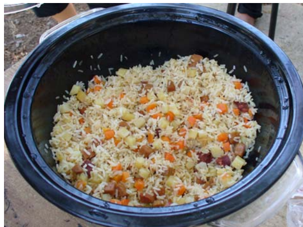
Solar cooked rice with carrots, potatoes and sausage, El Salvador