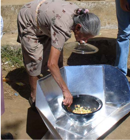
HotPot demonstration with ACUA, El Salvador

stoves, a complementary technology to solar cooking. Solar Household Energy personnel attended conferences with other PCIA-funded project managers, gaining useful insights and opening the door to possible future collaboration with organizations that focus on fuel-efficient stoves.