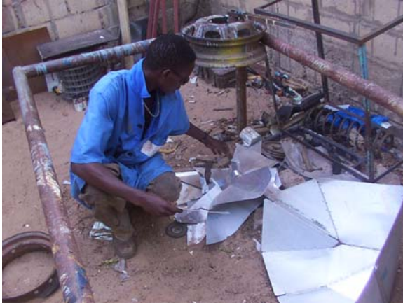
Metal worker constructing HotPot reflector, Mekhe, Senegal