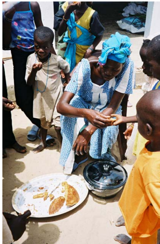
Pilot program participant selling a solar baked cake to children, Mekhe, Senegal

In Burkina Faso , Solar Household Energy collaborated with the Centre Ecologique Albert Schweitzer (CEAS) in a solar cooking dissemination project involving 100 HotPots. That group is also exploring the viability of local production of the HotPot reflector. (Technical requirements for the manufacture of the HotPot's tempered glass and enamel-coated steel components so far have precluded local sourcing, but efforts to identify new manufacturing sources are ongoing.) Burkina, like several other countries Solar Household Energy has targeted, has enacted legislation exempting certain alternative energy products from the punitively high import tariffs -- 50%, in Burkina's case -- applied to other goods. But the inconsistent application of that law by government officials at the border has hampered our efforts in that country. The “hit-or-miss” nature of obtaining relief under these laws demands persistence and patience.