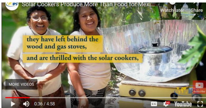
Picture links to YouTube video. IPS news’ video highlights SHE’s work in Oaxaca, Mexico, and around the world, featuring social enterprise customers as well recipients of humanitarian work.