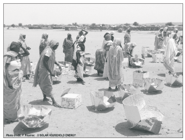
Figure 3. Women solar cooking in refugee camp in Chad.

The preliminary results indicate that introducing solar cooking has caused them [the participants] to reduce their wood use by an average of 25–40% after only two months. These savings are likely to grow over time and could be further increased by additional measures. The users are extremely enthusiastic about their new HotPots and have adapted their cooking to use them every midday meal.<sup>29</sup>