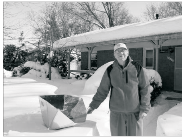
Figure 2. Solar cooking on a snow day in DC, Feb. 2010.

vegetables, rib roasts, hot dogs, hamburgers, and cakes. He is one of many people in Washington DC, and other places around the USA who cook frequently with a solar cooker (figure 2).