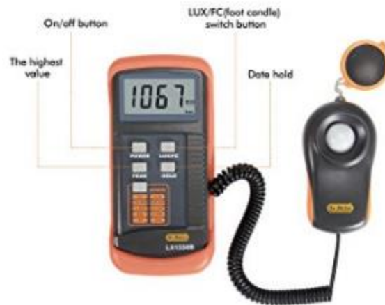
Figure 1. The LX1330B lux meter.

The lux meter and most pyranometers all use a silicon photodiode sensor, which has a peak spectral sensitivity in the near infrared at about 950 nanometers. The lux meter has a blue filter which adjusts the spectral response of the sensor closer to that of the human eye.